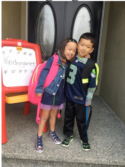
First day of School