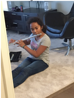
Playing the Flute