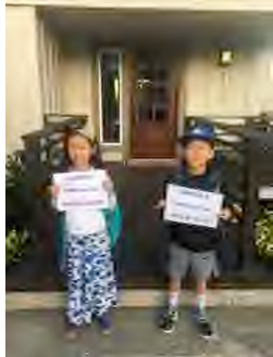
On to School