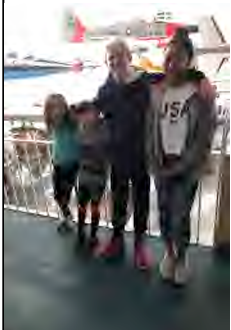
At museum of Flight