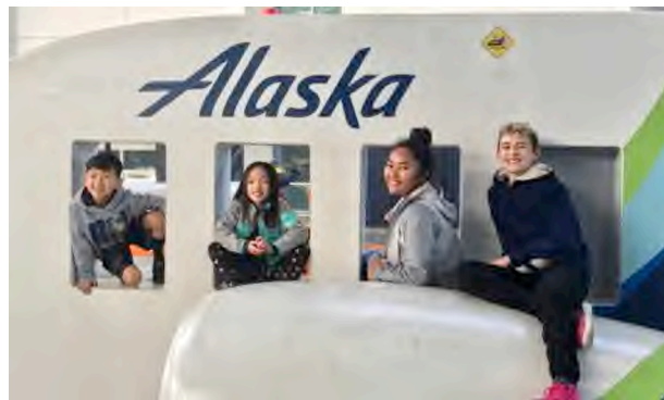
At the Museum of Flight.